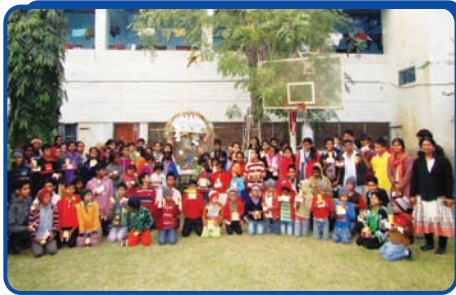
Children cherishing the gifts received on Christmas