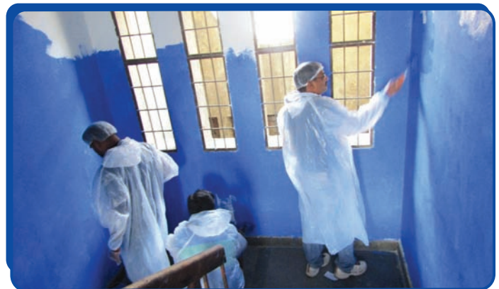
Allergan employees painting walls of Ashaniketan Boys Home