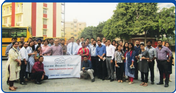
Barclays volunteers at Fr. Agnel School, Noida