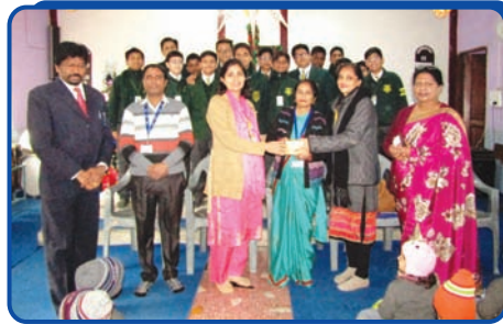
Students of St. Columbas School