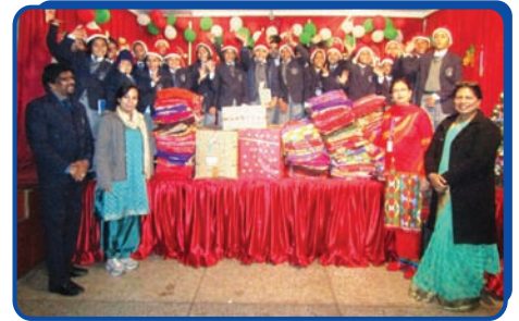
Students of Somerville School

Asha Deep Foundation would like to extend their gratitude to the following corporates, school and individuals for actively participating in the Christmas Gift Drive: