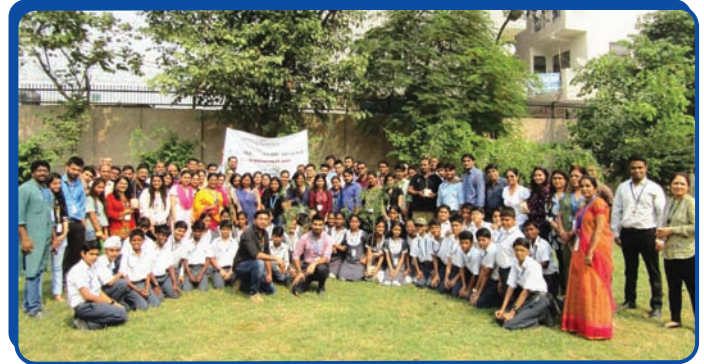
Barclays volunteers at Somerville School, Vasundhara Enclave

The Swachh Bharat Abhiyaan is an initiative by the Government of India with the aim to make the environment clean and green for the generations to come. Asha Deep Foundation promotes and believes in government policies and with the help of corporates, it seeks to act as a catalyst in implementing them. To help the State in achieving this mission, Asha Deep Foundation in collaboration with Barclays organised Tree Plantation drives in the Delhi-NCR region to spread the message of environmental sustainability. These drives were scheduled in 3 schools, namely- Somerville School, Vasundhara Enclave on 16th October, 2017, Fr. Agnel School, Noida on 20th October, 2017 and at ADF's St. James Convent School, Boys home and Girls home, Ghaziabad on 27th November, 2017.